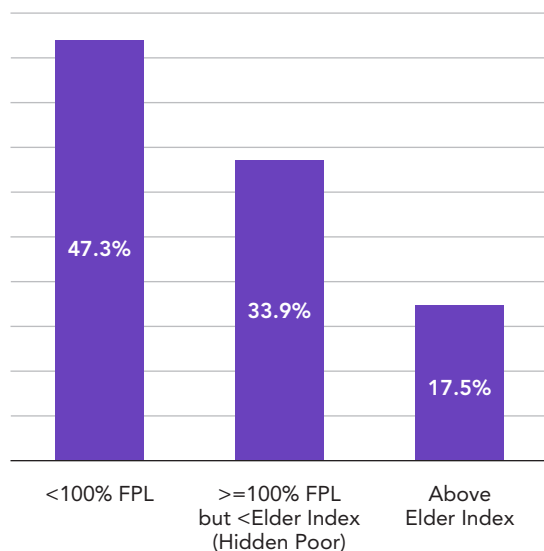
Fair & Poor Health by Elder Index, Ages 65+, California, 2013-14